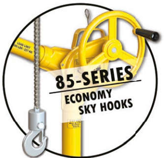
Lever Operated Friction Brake Roller Chain