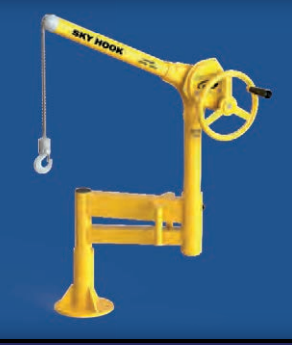
Bench Mount Sky Hooks w/ Articulating Arm