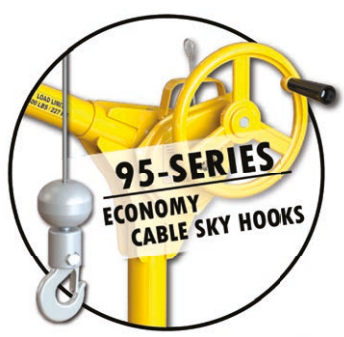
Lever Operated Friction Brake 3/16" Wire Rope

Economy Sky Hooks have a simple and easy to use friction brake as well as some additional features making them ideal for applications requiring lower cost solutions. As with all of our Sky Hooks, they are designed and built to meet ASME and OSHA standards.