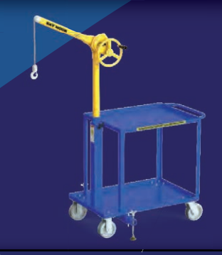
Mobile Cart Sky Hooks